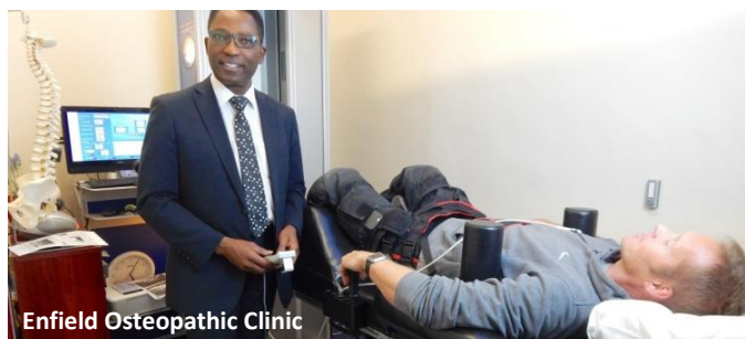
Enfield Osteopathic Clinic

* Clinician Referral Form: iddtherapy.co.uk/referral *