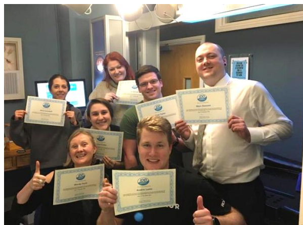
Bury Chiropractic team complete their IDD training.

We're delighted to welcome the Bury team to the IDD network and it's good news for back pain sufferers with this first IDD Therapy provider in Lancashire ☺ burychiro.co.uk