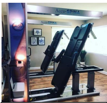
Many clinics have multiple Accu SPINA machines to provide IDD Therapy spinal decompression.

Combined with manual therapy and exercise, IDD Therapy programmes are leading the way in helping clinicians do more for unresolved back pain, neck pain and sciatica, especially for disc-related pathologies.