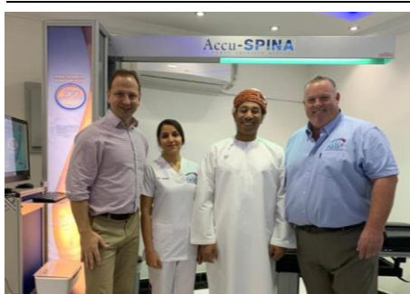
Muscat team with their Accu SPINA

Great to hear such success and well done to all the Harpenden team! harpendensportspinal.co.uk