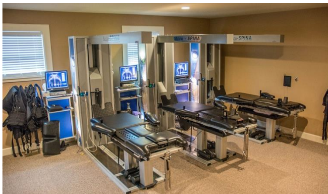
Gallatin Chiropractic Clinic Tennessee has three IDD Therapy devices

IDD Therapy was born in the USA in the late 1990s. It was developed by a team of neurosurgeons, engineers and rehabilitation specialists to address the failings of traditional traction and the natural limitations of what can be achieved for back and neck pain with manual therapy and exercise.