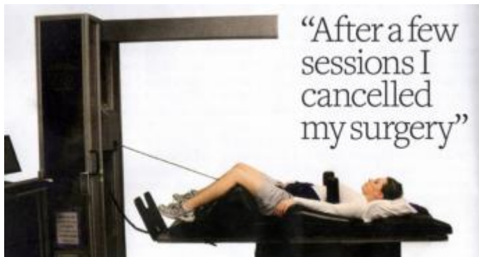
IDD Therapy making the headlines – Readers Digest

What we don’t usually appreciate with the overnight stars is the hours of practice and hard work that goes in for years to be able to perform and succeed on the day of emergence.