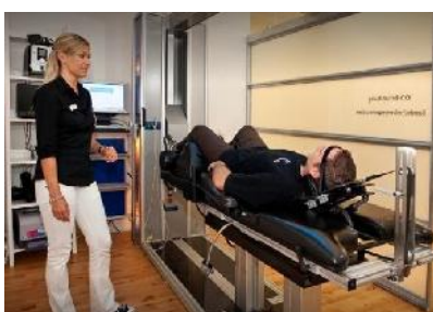
IDD Therapy for Neck Pain at Wirbelsäulenzentrum

With three main clinics in the central state of Hesse in Germany, Wirbelsäulenzentrum is a leading neurosurgery group helping patients with spinal disorders and back pain. As might be expected, the clinics provide a spectrum of treatments, from complex spinal surgery to physiotherapy and rehabilitation programmes, including IDD Therapy at two of the clinics.