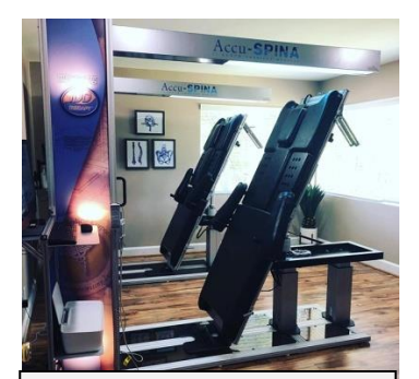
Many clinics have multiple Accu SPINA machines to provide IDD Therapy spinal decompression.

Combined with manual therapy and exercise, IDD Therapy programmes are leading the way in helping clinicians do more for unresolved back pain,