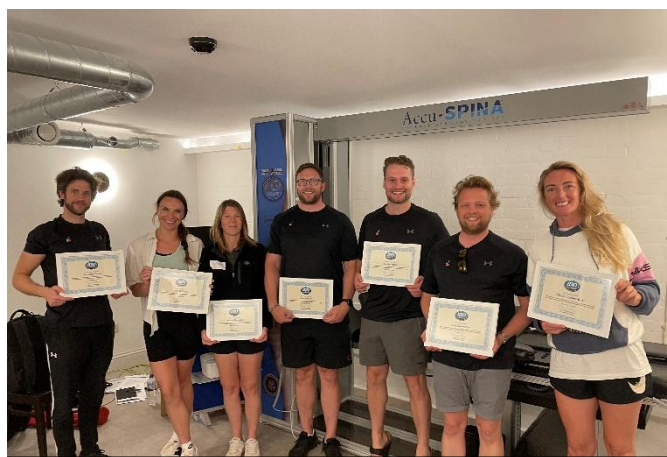
The physio team at Lyfe Health complete IDD training

Summer 2023 saw Lyfe Health take over a former branch of NatWest bank in Bournemouth. Part of The Medical Healthcare Centres and already providing IDD Therapy in Bristol, the project in Bournemouth is impressive.