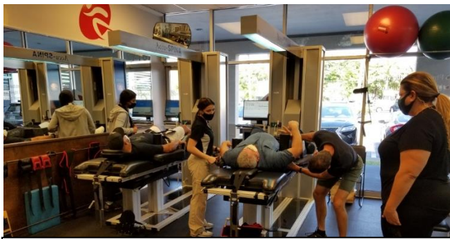
Physiotherapy rehab teams working with spine patients

There are of course many forms and causes of back and neck pain and much as we might like one, there is no single silver bullet or elixir to deal with every condition.